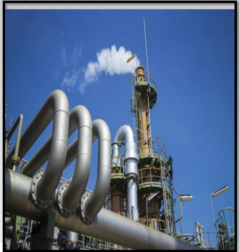
Pipeline & Pumps