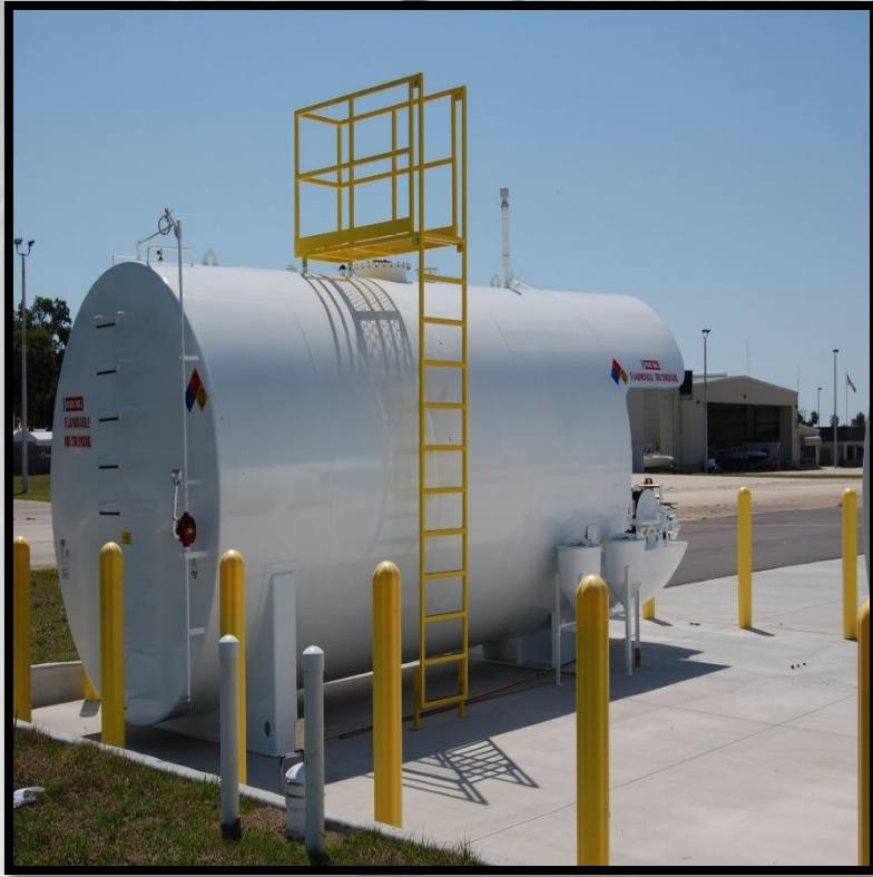
Fuel Storage Tank